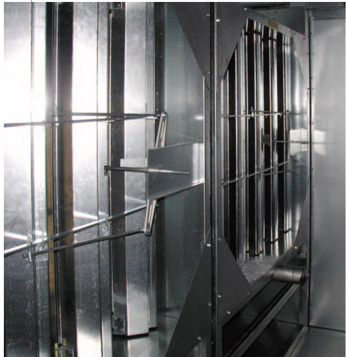
Two VIFB coils were installed to provide better mixing capabilities, prior to the air passing through the chilled water coils.

A service vestibule with convenience outlets