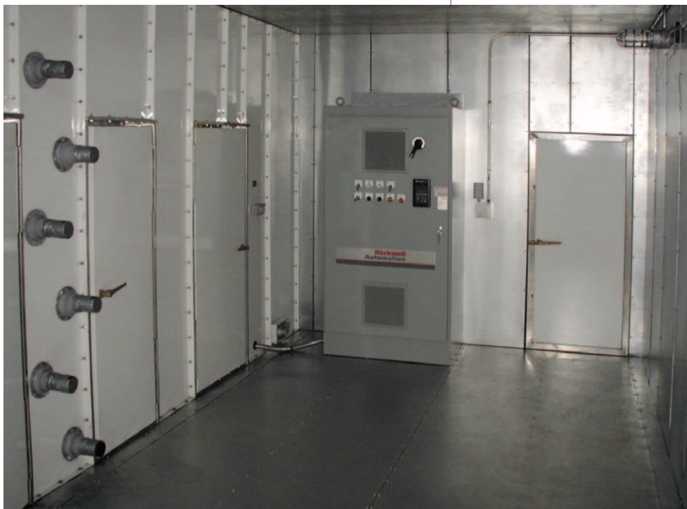
VFDs are mounted in the large service vestibule, with convenience outlets and vapor-proof mini-fluorescent lights installed to make maintenance more convenient.

and vapor-proof mini-fluorescent lights runs the