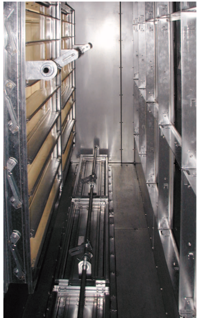
Return and outside air is filtered with 30 percent efficient prefilters and 95 percent efficient filters.