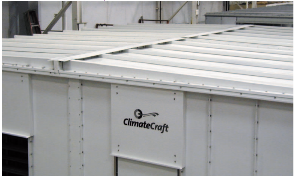
The exterior of the unit was powder coated in a custom color, and a pitched roof was specified to deflect rain and melting snow away from the unit.

As part of the initial renovation efforts, a new HVAC unit was needed to supply conditioned air to the cafeteria. Company engineers wanted a quality unit at a competitive price, meeting the same standards as units installed in the high tech manufacturing areas of the